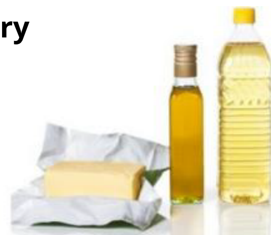
Fats, Oil & Grease