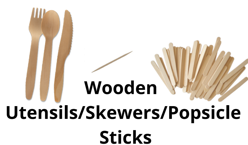
Wooden Utensils/Skewers/Popsicle Sticks