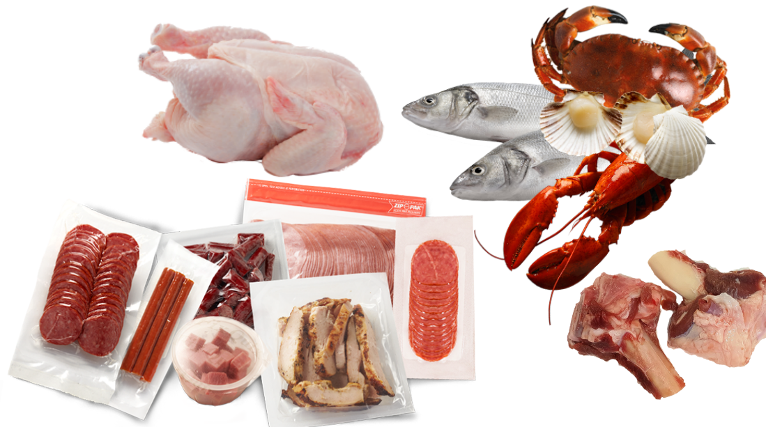
Meat, Seafood & Poultry