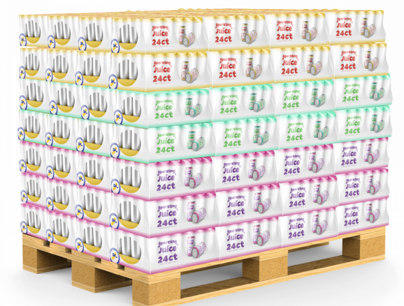
Pallets of Packaged Food Waste