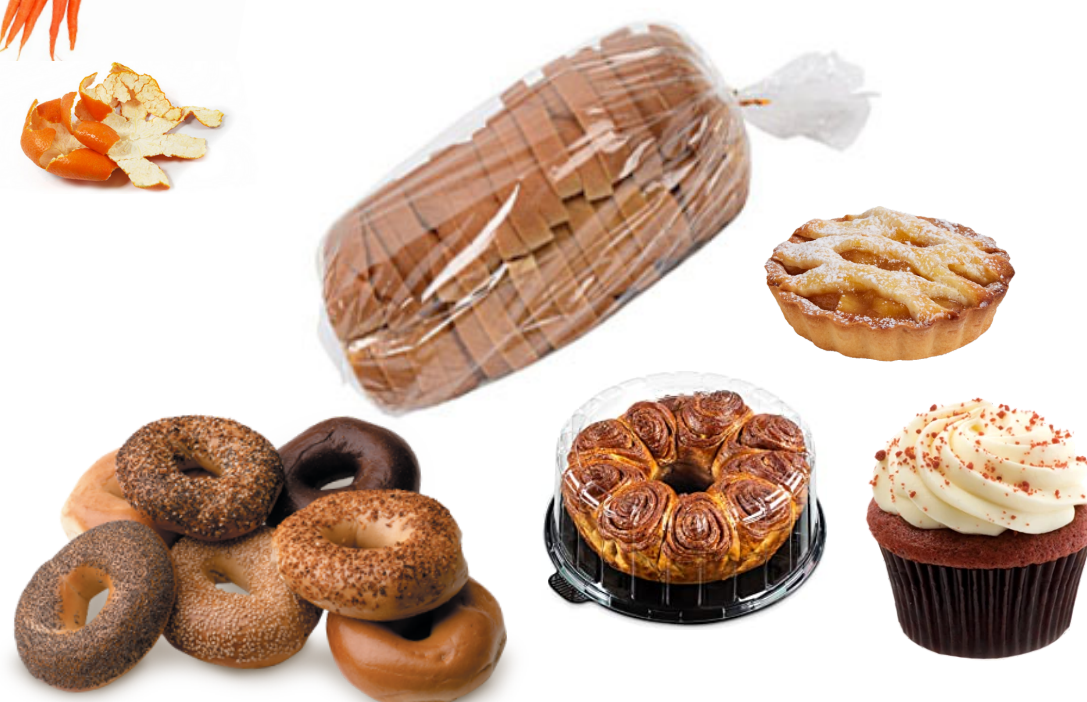
Bread & Bakery Items