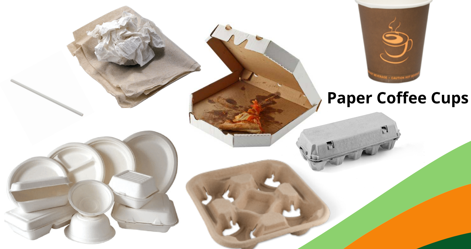
All Paper Products