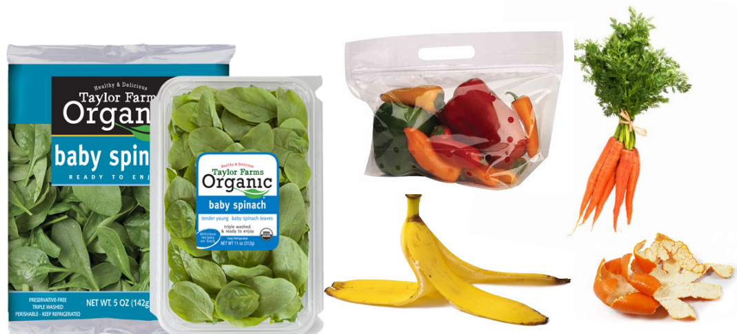
Produce & Peelings