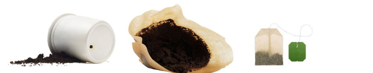
Coffee Pods, Coffee Grounds & Tea Bags