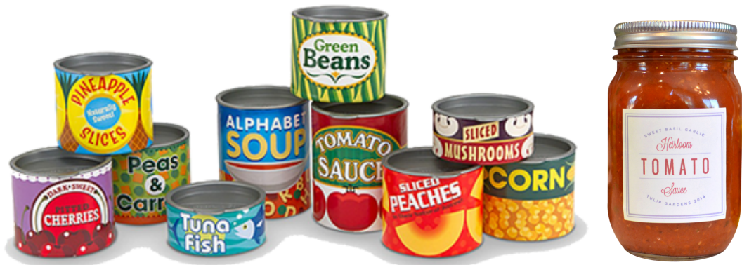
Jarred & Canned Foods

WE ACCEPT ALL FOOD WASTE, INCLUDING PACKAGING